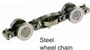
Steel wheel chain