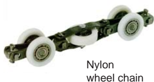
Nylon wheel chain