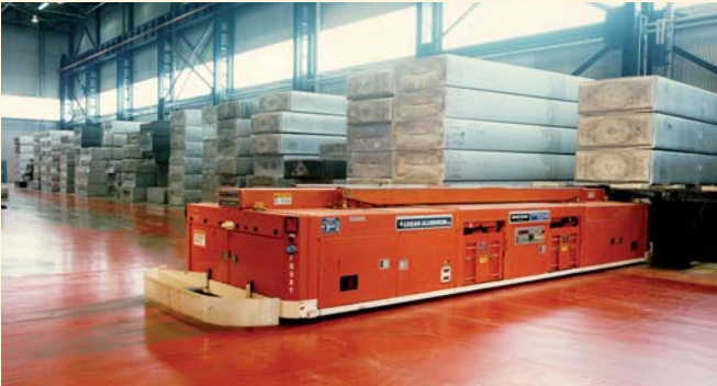
250,000 pound loads of aluminum ingots are delivered to a storage area and automatically unloaded by a vehicle mounted lift/lower deck.