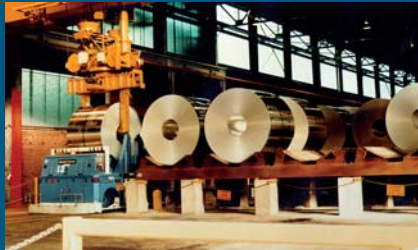
Utilizing an automated crane for direct loading of coils, this vehicle transports single coils between multiple processing centers. Load capacity of the vehicle shown is 60,000 pounds.