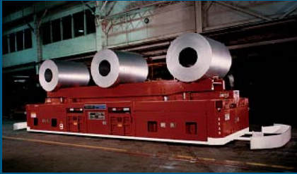
Various size coils at the finishing end of a mill are handled with this versatile coil handling AGV. The same vehicle is capable of handling work rolls. Vehicle handles up to 250,000 pounds.