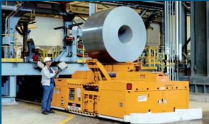
Steel coils weighing up to 120,000 pounds move between load stands serviced by automatic cranes and automated process equipment.