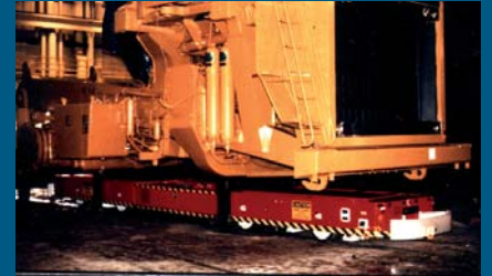
This ultra low profile vehicle moves 95,000 pound earth grader and dump truck chassis between various assembly operations.

Jervis B. Webb Company has over 35 years experience in the design and manufacture of AGV systems and system controls. We offer a complete line of medium capacity AGVs (1,000 to 10,000 pounds) as well as high tonnage AGVs up to 250,000 pounds.