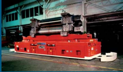
Work rolls are transported between Mill and Roll shop with less chance of damage. Backup rolls can be transported in the same manner.