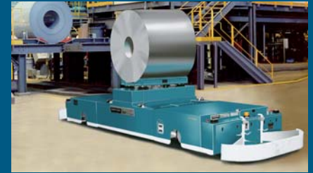
This unit load coil handling vehicle has an electric lift table and features a load capacity of 30,000 lb. Its low profile allows it to access low work stations.