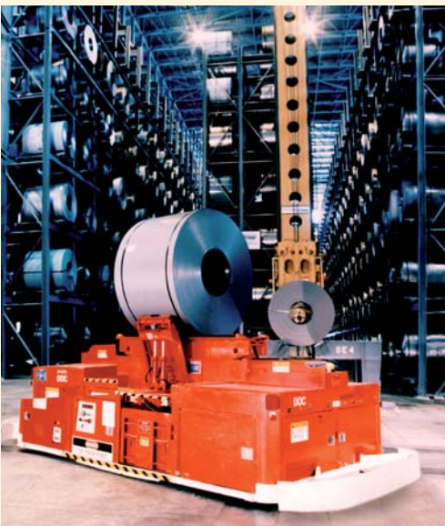
Coils are taken from various processing centers to the fully automated overhead fixed mast automatic storage and retrieval system.

For over a decade, Jervis B. Webb Company has developed and installed AGV systems to transport loads weighing up to 250,000 pounds. Vehicles are available in various load capacities and load configurations. Custom design capabilities provide vehicles that meet your special requirements. Advances in control and vehicle design have made our latest automatic guided vehicle systems more reliable, affordable, and flexible than ever before.