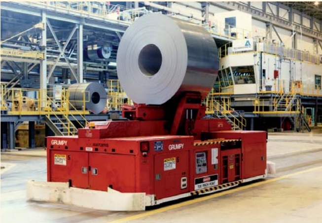
These AGVs interface with cantilevered pick/drop stations that can be supplied as part of the AGV system. A 100,000 pound load capacity AGV is shown transporting a steel coil.