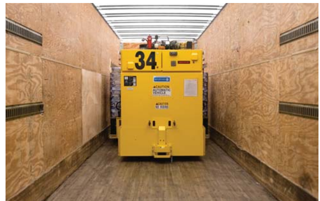
SmartLoaders can load trailers in virtually any load pattern