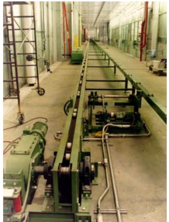
Above: Accumulation or Buffer Floor Skid Conveyor Systems have a chain or belt powered track on one side and a supporting idler roller track on the other side of the conveyor.